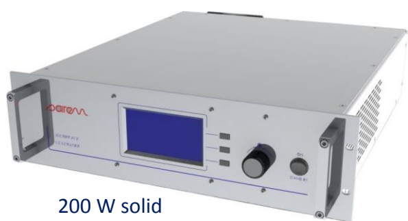
200 W solid state generator